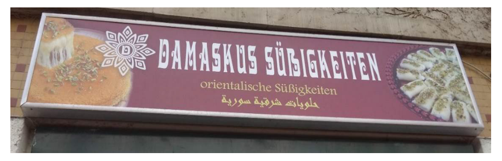
Figure 5. Bilingual sign of Arabic in a restaurant

stores and travel agencies, salons and communication (around 2%). Figure 5 exemplifies a bilingual sign denoting German-Arabic signage attached above the restaurant's entrance.