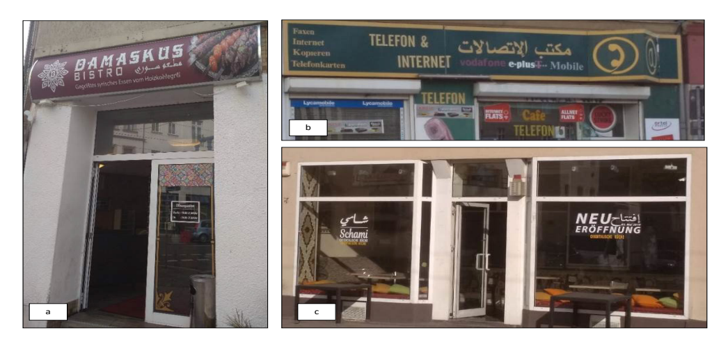
Figure 2. Three types of shop signs

In addition to taking pictures of the shop signs, one of the researchers also recorded communicative events and social exchanges in the LL area using field notes. As a participant observer, he was involved in the day-to-day commercial activities as a client. For example, when eating in a restaurant, he stayed there longer than expected to allow himself to observe the interaction between the sellers and the customers. After each observation, he spent enough time rewriting his field note and adding his reflection to it. The observation results were then discussed with the other researchers to understand the phenomenon more clearly.