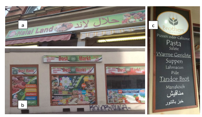
Figure 6. The combination of Arabic with other languages