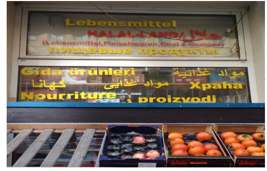
Figure 4. Arabic in multilingual signs

probably to catch the attention of customers and passersby. The German is also printed in red fonts but with smaller font sizes. At the same time, the other fonts of other languages are written in yellow, surrounding the red one. Smaller Arabic alphabets were also written in yellow color.