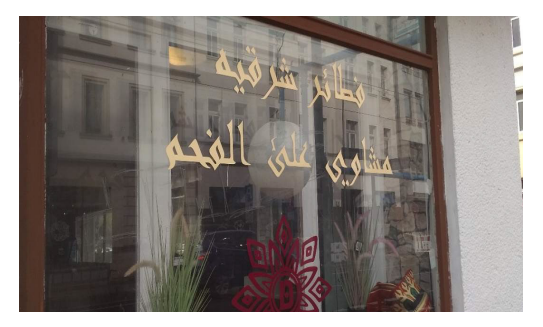
Figure 3. Monolingual Arabic

Regarding bilingual signs, Arabic appears in all shop businesses in Leipzig. Based on Table 2, Arabic is found in restaurants (36.8%), followed by groceries. Approximately 10% appear in jewelry