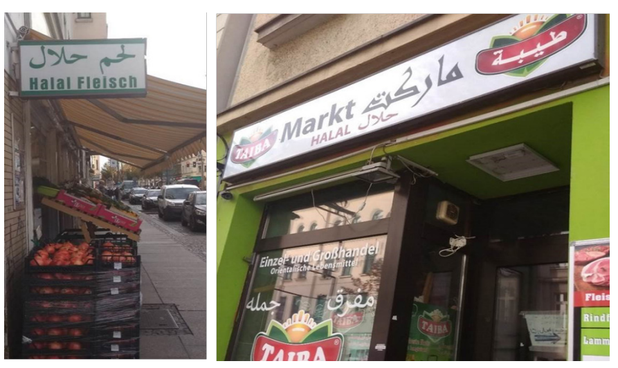
Figure 7. Stores with "halal" label

In the context of the European food production sector, however, "halal" as it is employed does not correspond to the religious meaning of the word, nor does it translate well (Salim & Stenske, 2020). Islamic legal experts also state it in their explanation of the term. Therefore, "[L] abeling products as halal is not exclusively a religious act- it is also a commercial activity pursued by religious organizations as well as by secular companies, for-profit" (Raza, 2018, p. 3). In Germany, the "halal" label's dual use might create issues of religious authority, legitimacy, and trust among the parties involved (Raza, 2018).